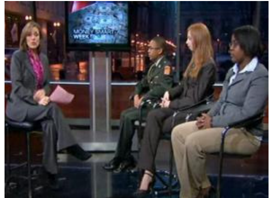
Interns and a volunteer mentor on the NBC 5 morning news in Chicago.

• We would like to thank our sponsor, HSBC – North America for their outstanding support of the On the Money program.